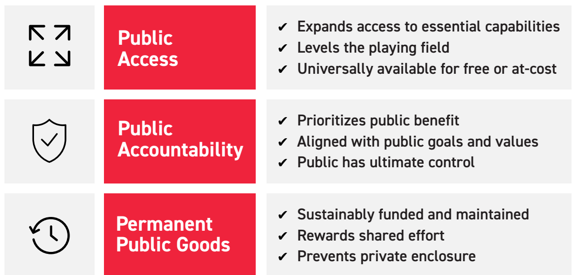
Table 1: Essential features of Public AI

Public AI has three key features which together ensure it advances the common good (Table 1).